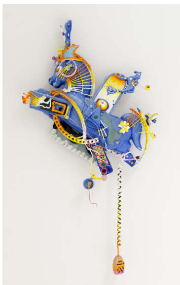
Pony Express, 2017 Oil, Crystals and Found objects 23 x 31 x 7 Inches / 58,5 x 79 x 18 cm