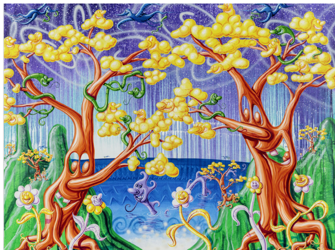
Paradis Perdu , 2018 Oil & Acrylic on Linen 70 x 90 Inches / 178 x 228,5 cm

It's been 25 years since Kenny Scharf's last solo exhibition in Paris!