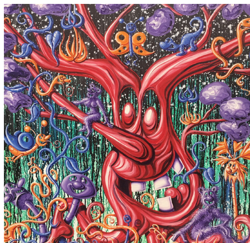
Arbre de Vie de Pluie, 2018 Oil & Acrylic on Linen with p/c Frame 40 x 48 Inches / 101,5 x 122 cm