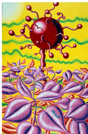
Flourish, 1986 Oil on Canvas 72 x 48 Inches / 182 x 122 cm

For any information, interview, image request or documentation, please contact the Galerie 75 Faubourg.