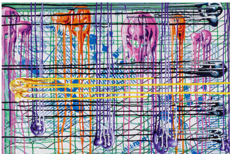
Driplaid, 2018 Oil, Acrylic, Silkscreen Ink & Diamond Dust on Canvas 24 x 36 Inches / 61 x 91,5 cm

FROM 20 TH OF OCTOBRE TO 23 TH OF NOVEMBRE, GALERIE 75 FAUBOURG