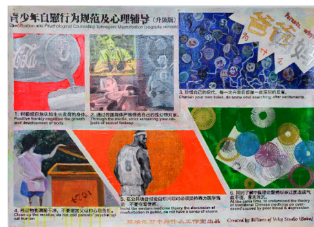
Specification and Psychological Counseling Teenagers Masturbation (upgrade version), 2014 Acrylique sur toile de lin 80 x 110 cm

Thus in my recent experiments, I started directly mingling “images” and “words”, or “drawing” and “writing”. “I have to become someone (a painter) who forbears and is ignorant, who is exhausted and yet humorous” was one sentence of a “life sketch” I made spur-of-the-moment in my notebook—a gridded notebook with little squares.