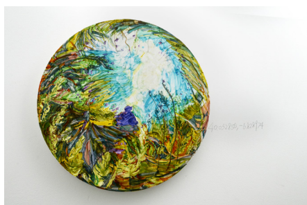
40.032850, -6.828974, 2014 Acrylic markers pen on canvas 40 cm

The initial intent of the Copy of the Nature series was simply to solve a basic question of framing I had with extensive landscapes. When I could not help but superficially face the landscape I am perusing—one I was about to depart from—"portraying from life" (xiesheng) was the best mode of practice. After I finished "writing" (xie), I recorded the GPRS code of that reflective sphere (which belonged to or which I placed on sculpture and architecture within the city) as the title of the piece.