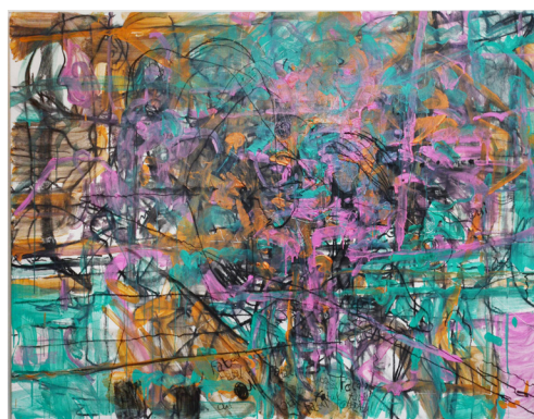
All About < >-No.5, 2014 Acrylic on canvas(linen) 162 x 208 cm