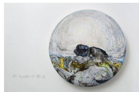
40.242441, -6.799176, 2014 Acrylic markers pen on canvas 30 cm