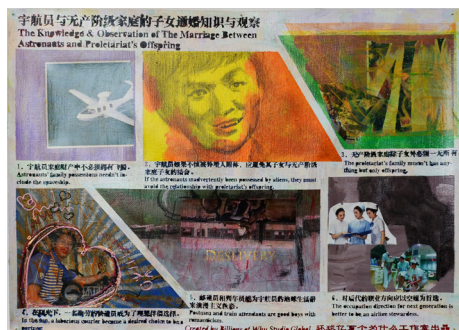
The Knowledge & Observation of The Marriage Between Astronauts and Proletariat's Offspring, 2014 Acrylique sur toile de lin 80 x 110 cm

The Teenage Demo series is an exercise in drawing with a nostalgic and Pop-like form. The meaningful part for me lay in the process of creation and the fun arising spontaneously between the selection of the captions and the expression of the images. During the same time period when I was creating these “propaganda paintings”, I shot two videos “Shout Painting” and “Facebook Demo”, which jokingly discuss everything in the whole wide world with painting as an excuse.