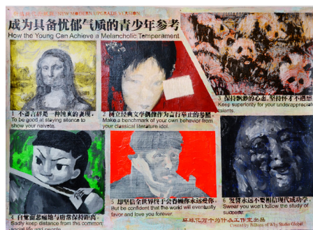
How the Young Can Achieve a Melancholic Temperment, 2014 Acrylique sur toile de lin 80 x 110 cm