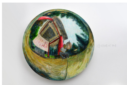
29.557569, 115.98319, 2013 Acrylic markers pen on canvas 50 cm