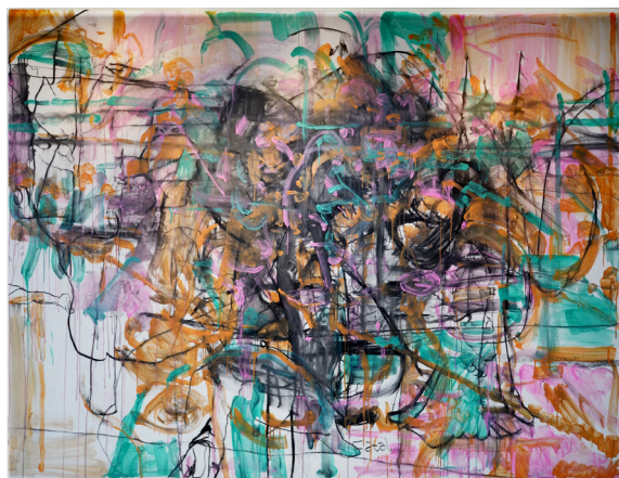
All About < >-No.4, 2014 Acrylic on canvas(linen) 235 x 310 cm

The series All about < > is the result of an attempt I made when I accepted the consequences of a mistake and made the best of it—"painting a film". I threw my efforts at painting under a moving image projected on the wall, having it and the light and shadows engage in an intimate relationship which belies its appearance. Each drawing seems like a nervous game of overcoming obstacles—the end point being that utopia which "abstraction" wishes to found.