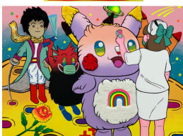
Yuree Kensaku, Cosplay Fever , 2020 Acrylique, paillettes et collage sur toile / Acrylic, glitter and collage on canvas 65 x 85 cm / 25 3/5 x 33 1/2 in © Yuree Kensaku. Courtesy galerie arnaud Lebecq