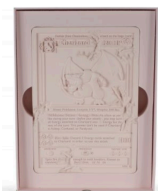
Daniel Arsham, Crystalized Charizard , 2020 Résine / Resin 30,5 x 21,8 x 2,5 cm / 12 x 8 5/8 x 1 in Ed. 500 © Daniel Arsham Inc