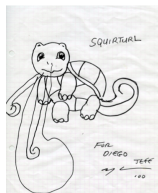
Jeff Koons, Sans titre / Untitled (Squirtul) , 2000 Feutre sur papier / Felt pen on paper 21,8 x 16,8 cm / 8 9/16 x 6 5/8 in Collection particulière / Private collection © Jeff Koons