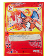
David Heo, 1999, 2020 Sérigraphie sur papier Mohawk / Screenprint on Mohawk 71 x 51 cm / 28 x 20 in Ed. 11/40 © David Heo