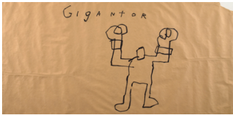
Jean-Michel Basquiat, Sans titre / Untitled , 1981 Encre sur papier / Ink on paper 68,5 x 141 cm / 27 x 55 1/2 in © The Estate of Jean-Michel Basquiat. Licensed by Artestar

GALERIE 75 FAUBOURG 75, rue du Faubourg Saint-Honoré Paris 8ème tel. +33 (0)1 44 51 75 75 fax +33 (0)1 49 24 91 57 info@galerie75faubourg.com