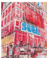
Enoc Pérez, Sega Building , 2020 Huile sur toile / Oil on canvas 106,7 x 87,6 cm / 42 x 34 1/2 in © Enoc Pérez