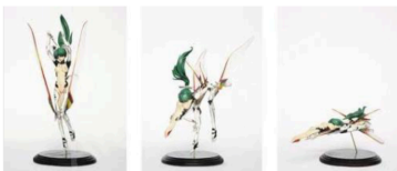
Takashi Murakami, Second Mission Project Ko2 Strikes Back , c. 2000 Plastique peint et bois / Painted plastic and wood 40 x 100 x 25 cm / 15 3/4 x 39 1/3 x 9 5/6 in Edition © Takashi Murakami/Kaikai Kiki Co., Ltd.