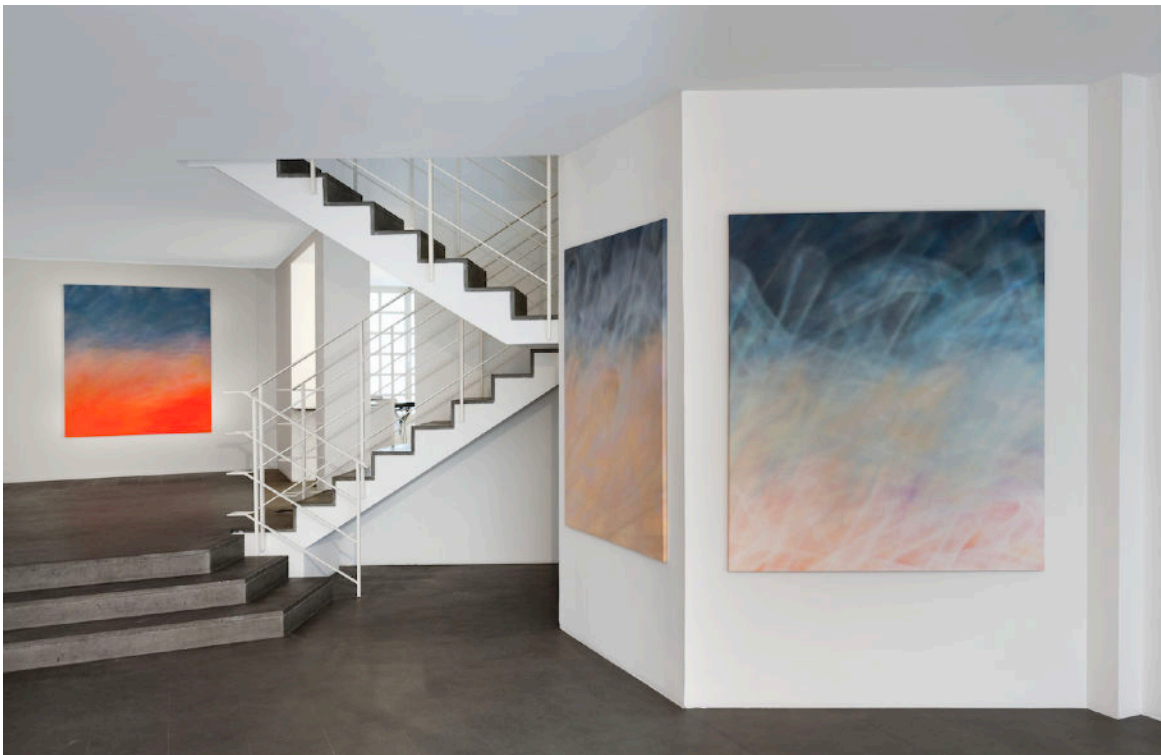
View of the exhibition Voyages sur le motif at Galerie 75 Faubourg, Paris, January 27 th – April 7 th , 2023