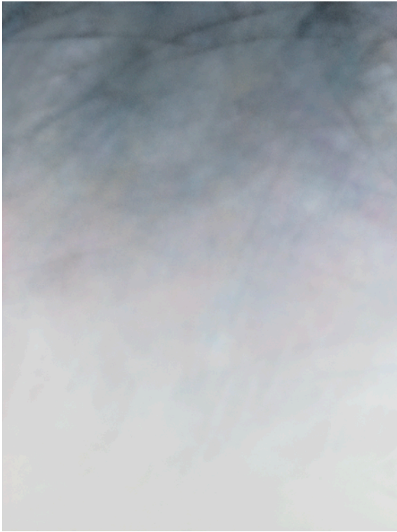
Champ-de-Mars, Paris, 15 juillet 2020 (soir) Peinture au spray sur toile / Spray paint on canvas 160 x 120 cm / 63 x 47 1/4 in