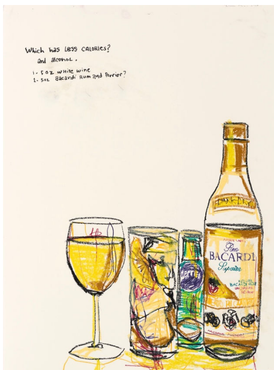
Untitled, 2023 Wax pencil on paper 30 x 22 in