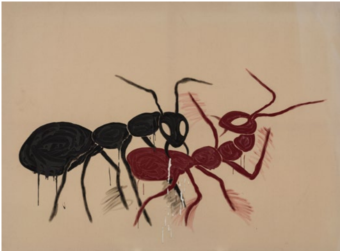
Red and Black Ants 1981 Painting on canvas 148,9 x 203,2 cm