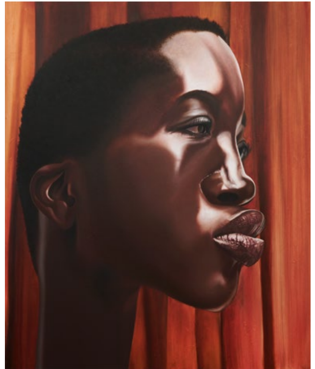
Statuesque 2024 Gesso, oil, and oil wash on canvas 72 x 60 in