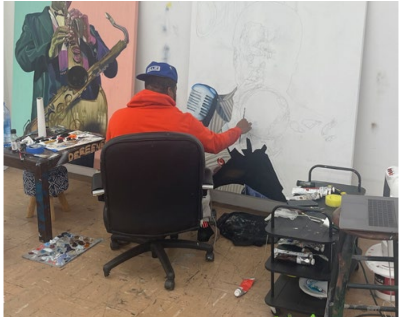
Brandon Deener painting Sketches of Miles 2024 Oil and oil wash on canvas 60 x 48 in