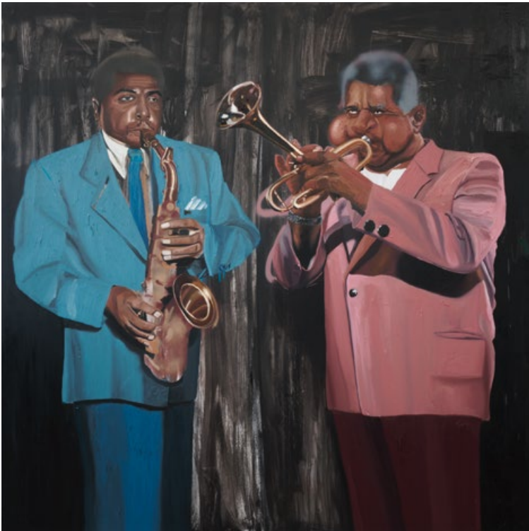
Players of the Horn 2024 Acrylic, acrylic wash, oil, oil wash, spray paint, and pigment stick on canvas 72 x 72 in