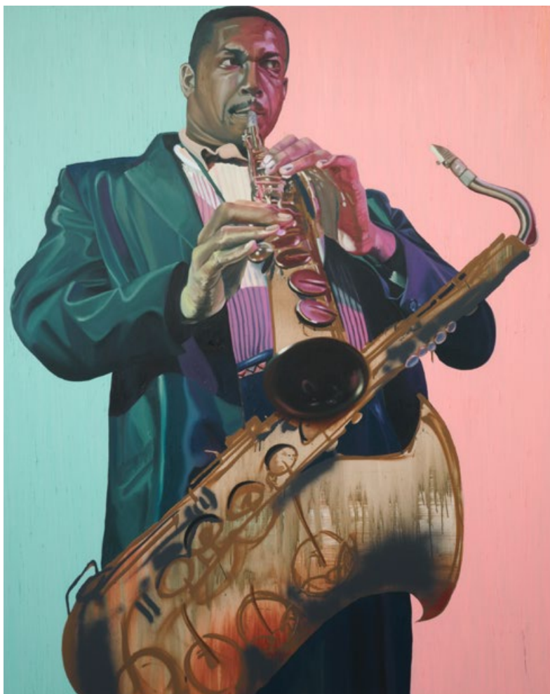
Soprano and Tenor 2024 Acrylic, acrylic wash, spray paint, pigment stick, and oil on canvas 60 x 48 in