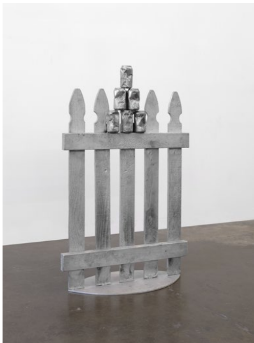
Where Sunday Ended 2025