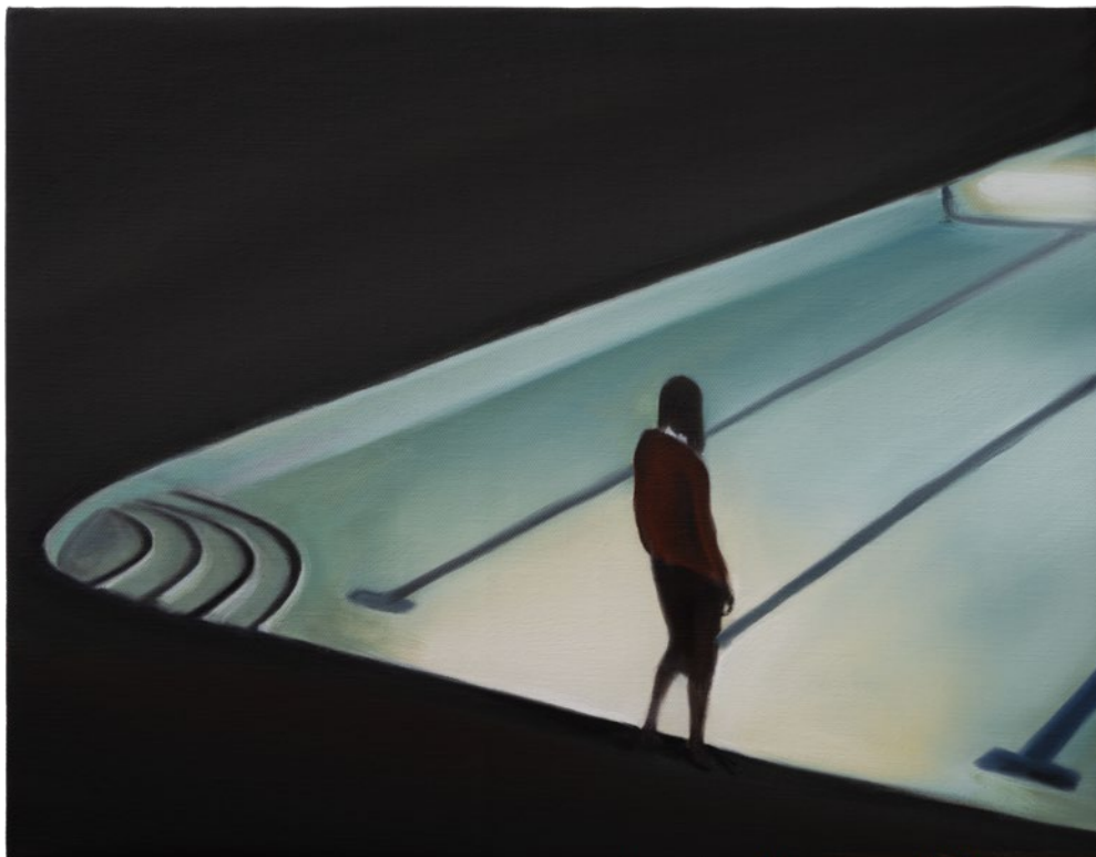
Not Sure It Ever Happened, But I Remember It Perfectly (1) 2025 Oil on linen 14 x 18 in (35,6 x 45,7 cm)