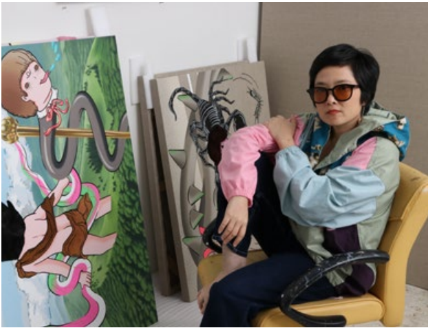
All artworks © Yuree Kensaku