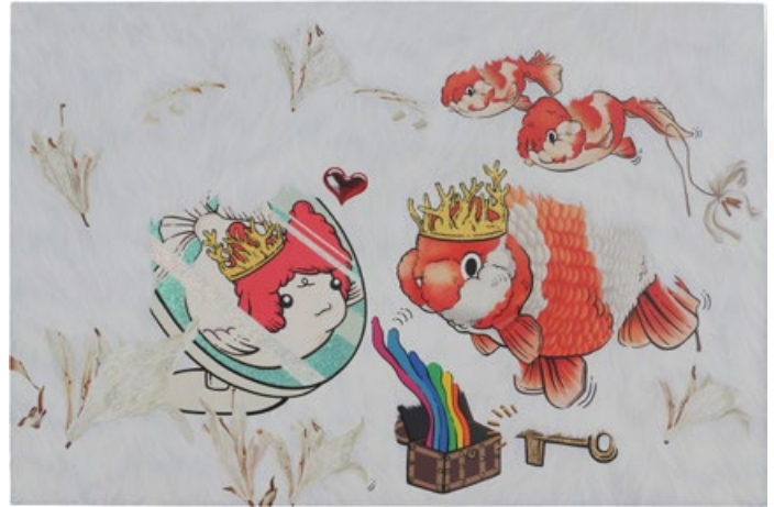
The Frailty: The Forgetful Goldfish and the Wilting Lilies 2025

Acrylic, glitter, collage, copper and silver leaves on canvas 80 x 120 cm